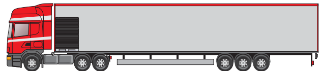
Return transport: 64 empty DUROPAC systems, filling only 1.2 m trailer length