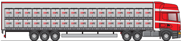
Outward transport: 64 fully loaded DUROPAC systems